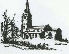
St Peter's Kirby Bellars

The quiet peaceful village of Kirby Bellars derives its name from the Beler family, The monument to Sir Roger Beler, a mediaeval lord of the manor, can be seen in the south aisle of St. Peter's Church. To your right, you can see the earthworks of the moated Kirby Priory, founded as a chantry in 1316, becoming an Augustinian Priory in 1359, and dissolved in 1534. A detour down Washdyke Lane and across the river reaches the remains of the old lock, and the line of the canal which has been filled in at this point. Beyond Kirby Bellars nursery the Priory Wildlife and Water Park is a small nature reserve on former gravel workings, supporting abundant birdlife.